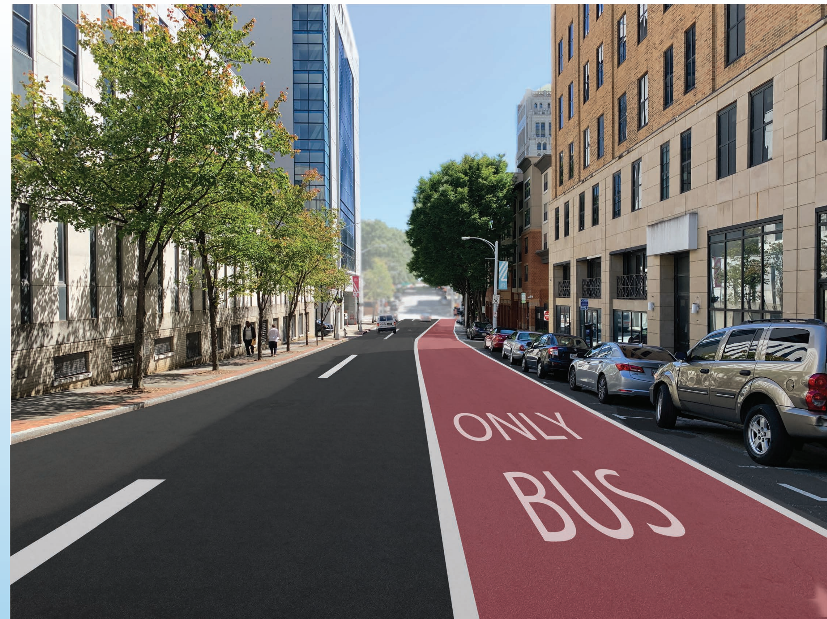
Downtown: Mitchell Street between Pryor Street and Central Avenue (looking southeast)