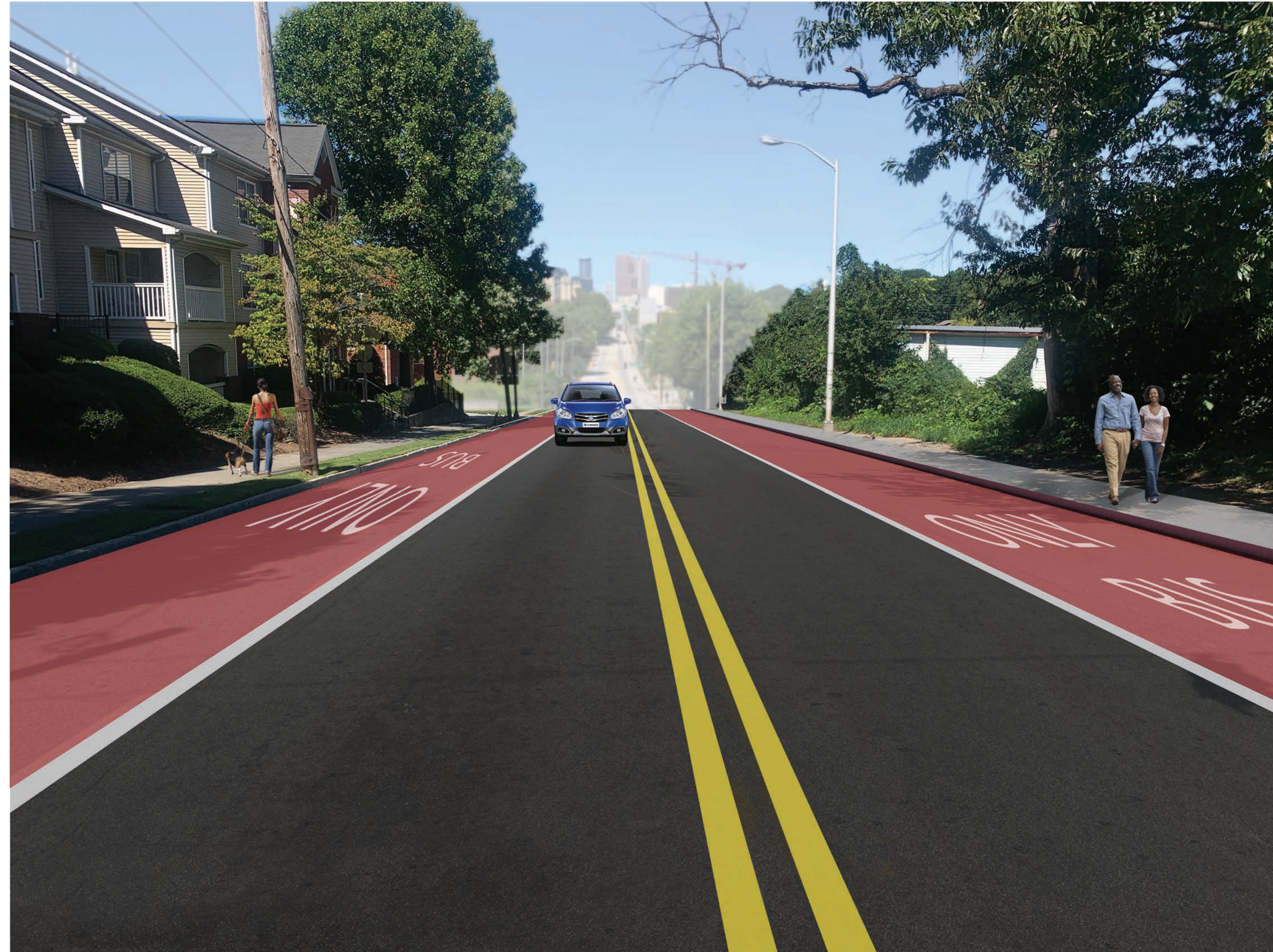
Summerhill: Hank Aaron Drive between Atlanta Avenue and Ormond Street (looking north)