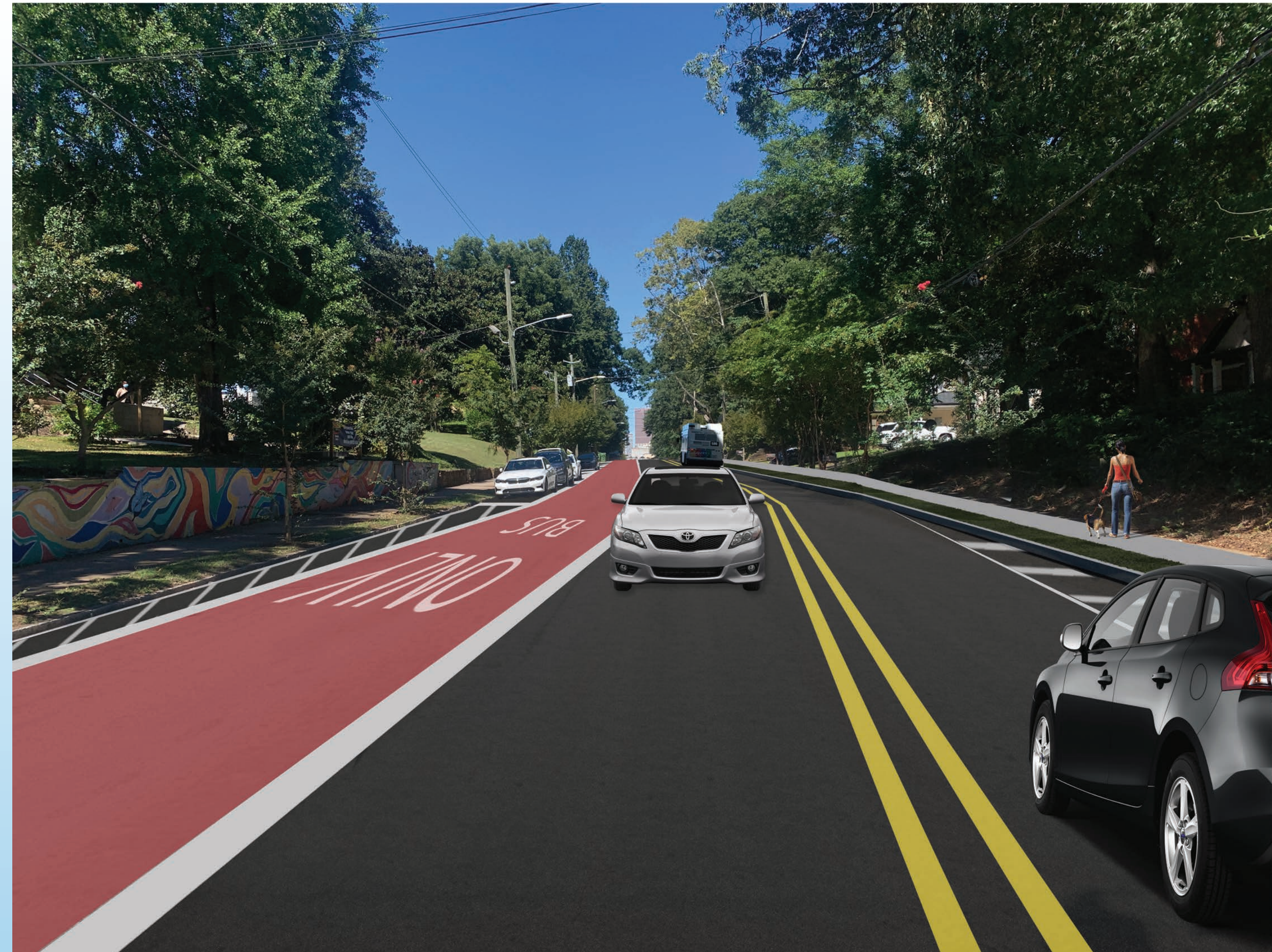
Peoplestown: Hank Aaron Drive between Haygood Avenue and Atlanta Avenue (looking north)